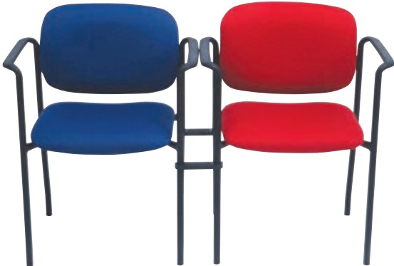
Optional ganging brackets

14 Gauge 7/8" tubular frame construction